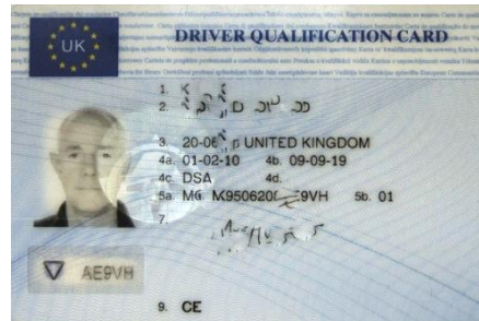
Driver Qualification Card (DQC)