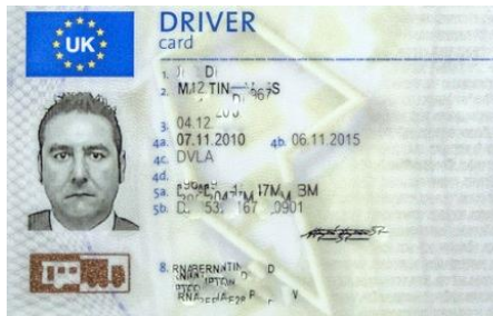
Digital Tachograph Driver Card